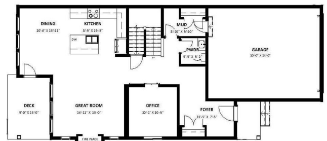
MAIN 1,085 SQ.FT. GARAGE 477 SQ. FT.